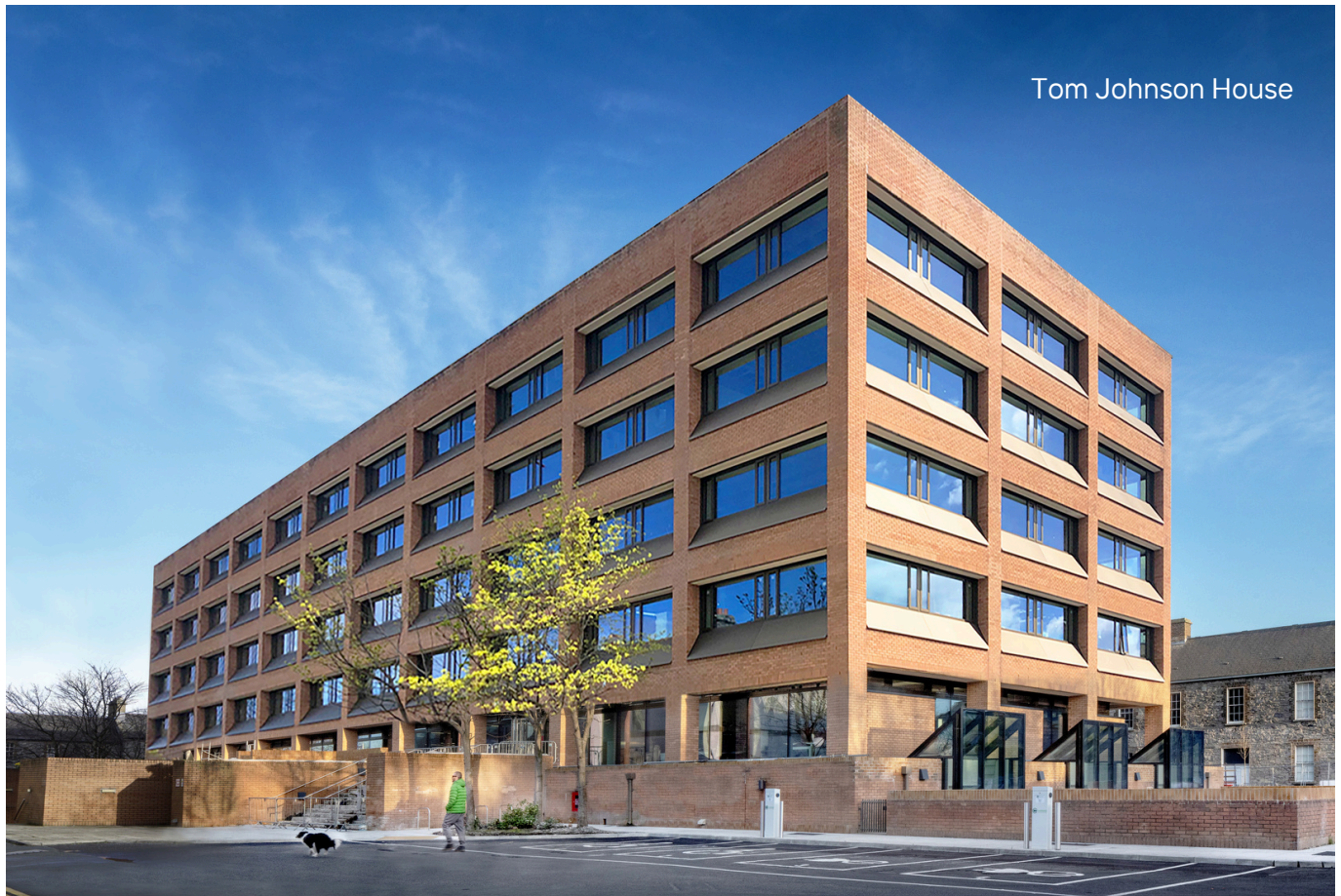
Tom Johnson House

We have successfully completed a diverse range of commercial projects, including office blocks, department stores, restaurants, retail outlets, fit-outs, and refurbishments. Many of these projects required phased completion to ensure uninterrupted facility operations.